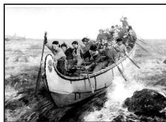
VOYAGEURS ~ CIRCA 1750